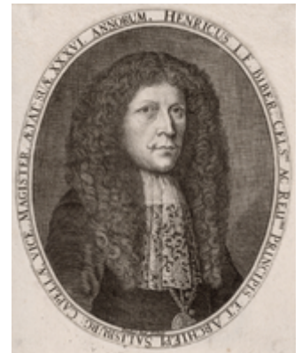
Heinrich Biber in 1681

Kroměříž is also a birthplace of Max Švabinský (born 17 September 1873; died 10 February 1962), one of the most important Czech painters of the last century. A permanent exhibition called Max Švabinský Memorial can be seen in the Museum of Kroměříž Region (Czech: Muzeum Kroměřížska ), located in the lower part of Big Square ( Velké náměstí ), near the entrance to the Bishop's Palace (Gallery - Titian's Marsyas).