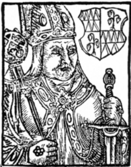
Bruno von Schauenburg, bishop of Olomouc.

The settlement, inhabited by Slavs since at least the 7th century, was founded in 1260 by Bruno von Schauenburg, bishop of Olomouc. Bruno chose Kroměříž to become his see and he also made his castle the centre of his dominion, which consisted of more than 60 vassals from all over Moravia. Kroměříž is referred to as a market village in a document by Přemysl Otakar II from 1256, but by 1266 it was already referred to as a town.