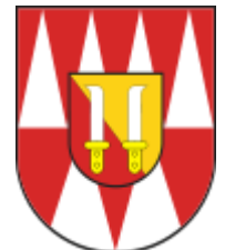
Coat of arms